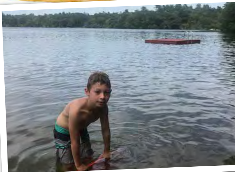
Cape Cod lakes stays warm enough for an early fall dip.